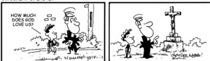
6th SUNDAY OF EASTER

Register at: https://www.cc-nh.org/events/dementia-support-group/